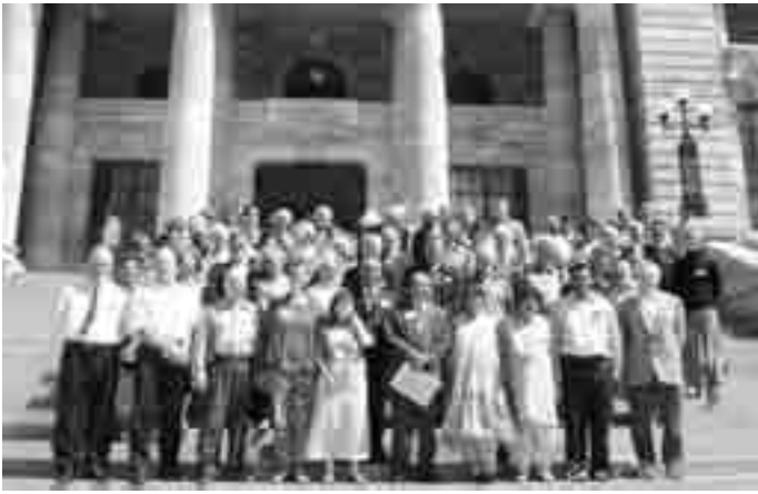
Interfaith Forum Delegates on the steps of Parliament