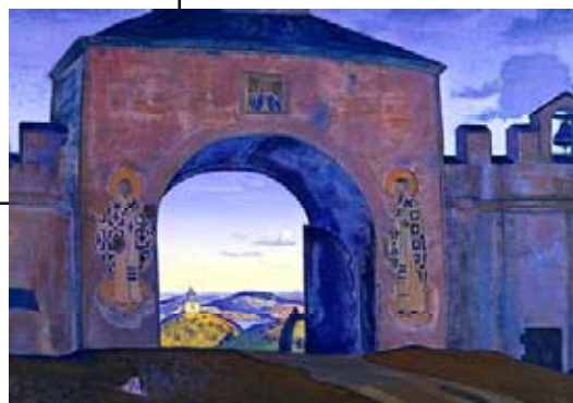
And We are Opening the Gates – Nicholas Roerich