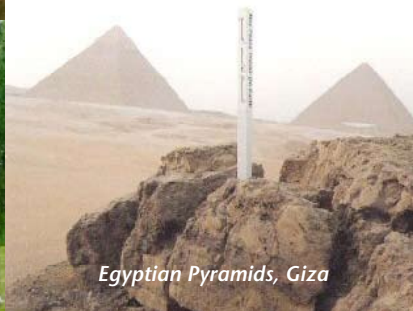
Egyptian Pyramids, Giza