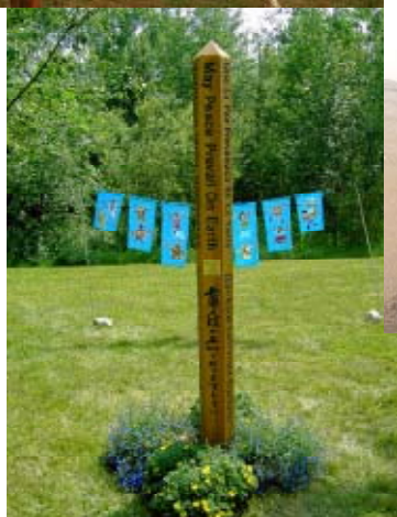
Meditation Garden, Vermont