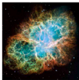
Nebula - Nasa space photos