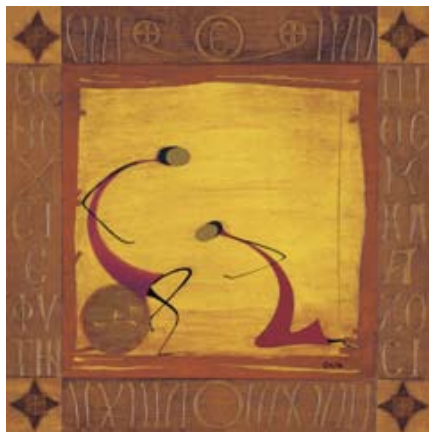
Forgiveness Art Print – Thierry Ona

(2) This right may not be invoked in the case of prosecutions genuinely arising from non-political crimes or from acts contrary to the purposes and principles of the United Nations.