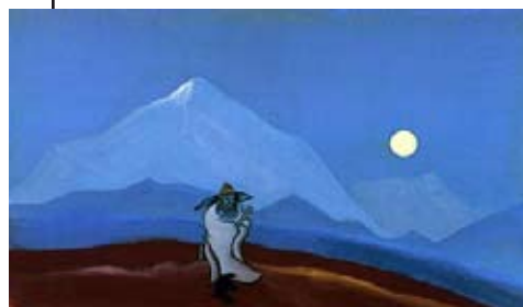
Philosopher Silence – Nicholas Roerich

*plus package and postage 1–2 books $4.00; 3 books $5.50; 4+ books $7.50; if the total value of the books is over $120.00, postage is free