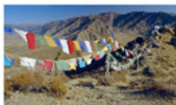
Prayer flags in Nepal