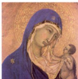
Madonna & Christ icon