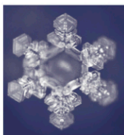
"Christmas" - Dr Masaru Emoto